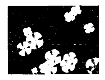
Fig. 2 POM photograph of 6-FBAPh/TPA in m-cresol at 20wt% at room temperature ( \times 180 ).